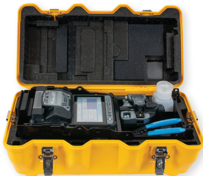
Workstation in Transit Case

Backed by the best service team in the industry, the Fujikura 41S is the ideal splicer to use when portability, ruggedness, and reliability are needed for your splicing application.